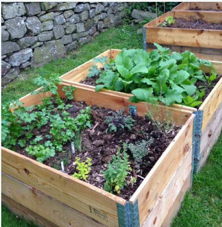
Incredible Edible community garden plot in Reeth